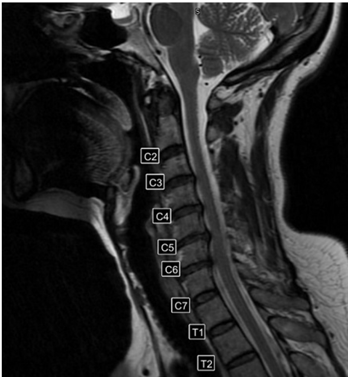
Fig. 2. Magnetic resonance scan of the cervical spine demonstrating diffuse degenerative changes.

Given this information, the patient was diagnosed with brachioradial pruritus and trialed on gabapentin. She was slowly titrated up on this medication over several weeks until she reached a steady state. Initially the patient felt moderately sedated when starting the medication and would primarily take the medication before bed-time so it would not interfere with her daily routine. The patient